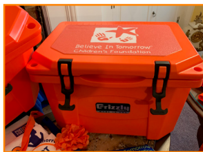
Grizzly 20 cooler with Believe In Tomorrow logo