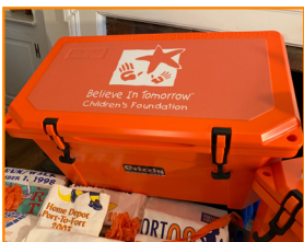
Grizzly 60 cooler with Believe In Tomorrow logo