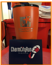
Grizzly insulated BIT logo cup with $100 gift card to Charm City Run