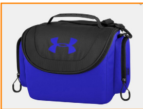
Under Armour 24 can soft cooler with Port To Fort Logo