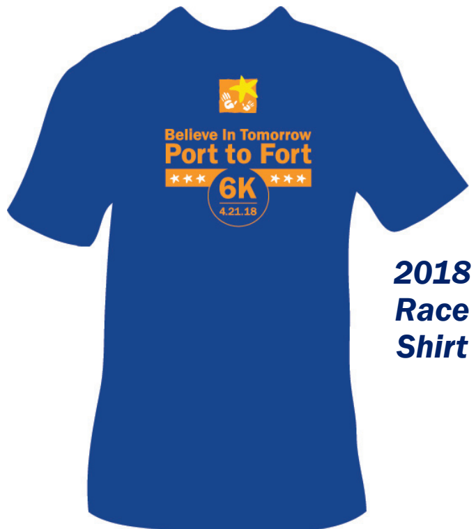
2018 Race Shirt

*Race day registration and packet pickup (at the race) will begin at 7:00 am at Coke Field.