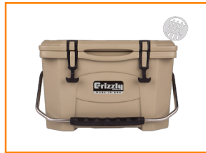
Grizzly 20 cooler with Believe In Tomorrow logo