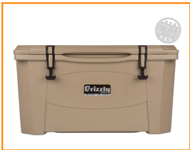
Grizzly 60 cooler with Believe In Tomorrow logo